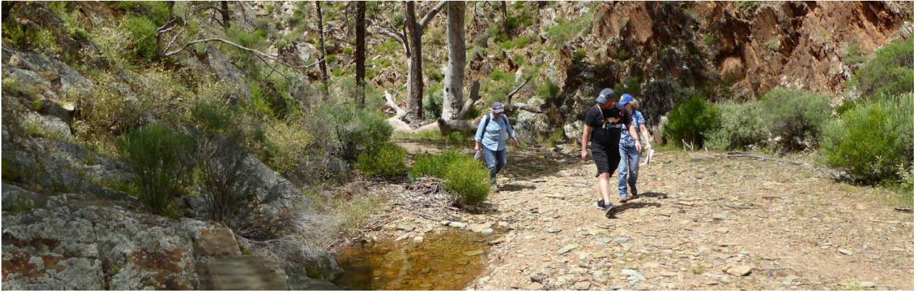
Nothing like enjoying the local countryside. Good tracks, even some water about. Verrrry Scenic.