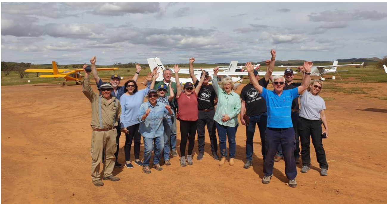
Put your hand up if you had a good time!!!!!!