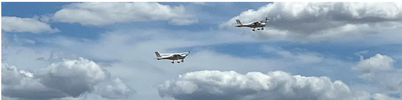
Flying in Company