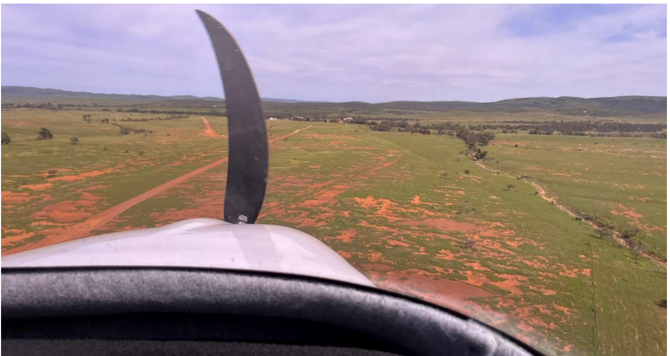
Clear view of the approach to Bendleby.