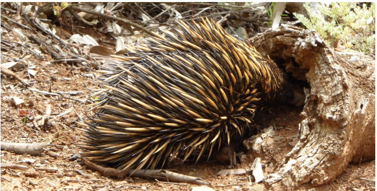
I am not volunteering for the oven