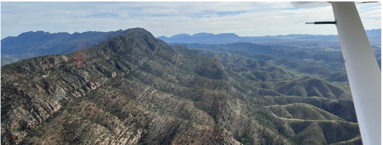
Beautiful view of the ridges on the way