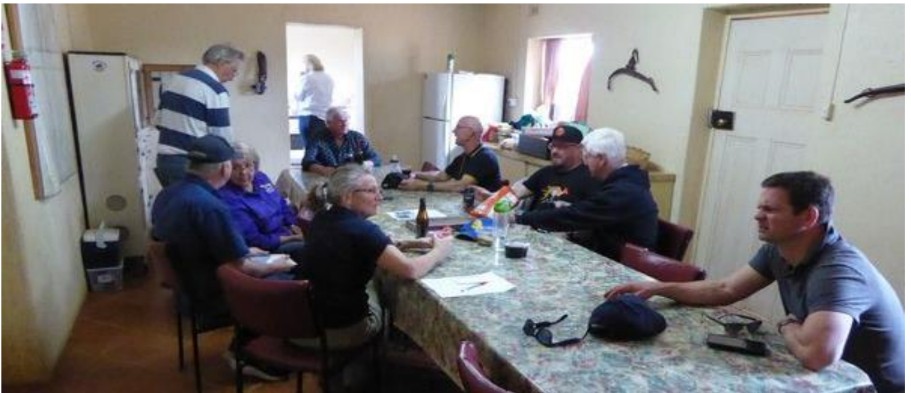
Drinks before dinner. I wonder who is cooking the roast?