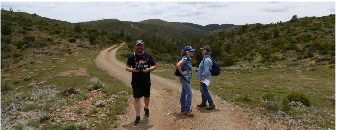
Ummm don't know. I am sure it was around here somewhere.