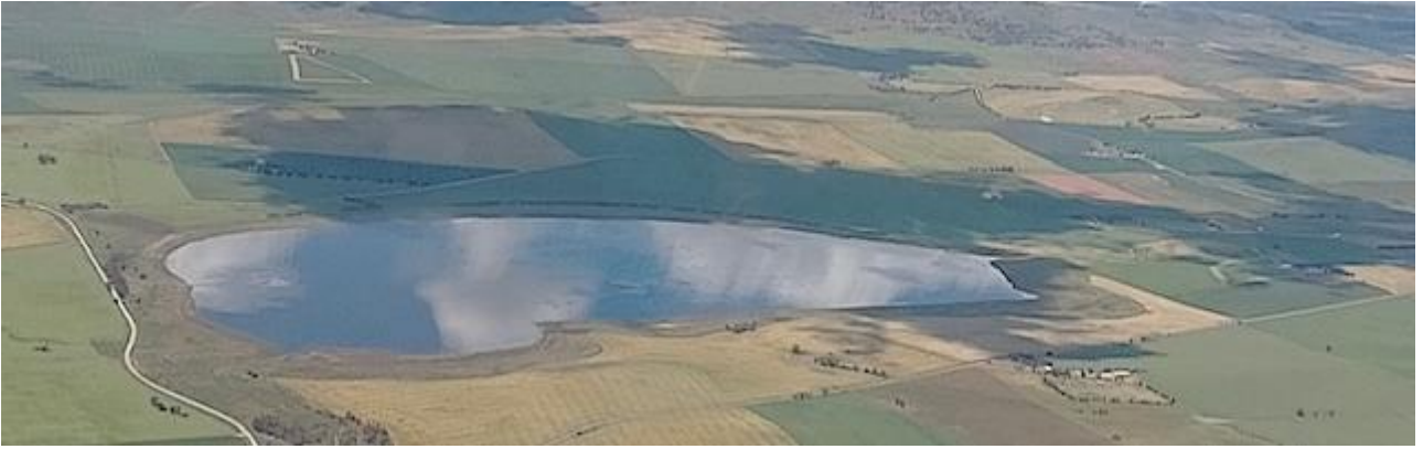
PORTERS LAGOON. Who can remember seeing it full of water?.