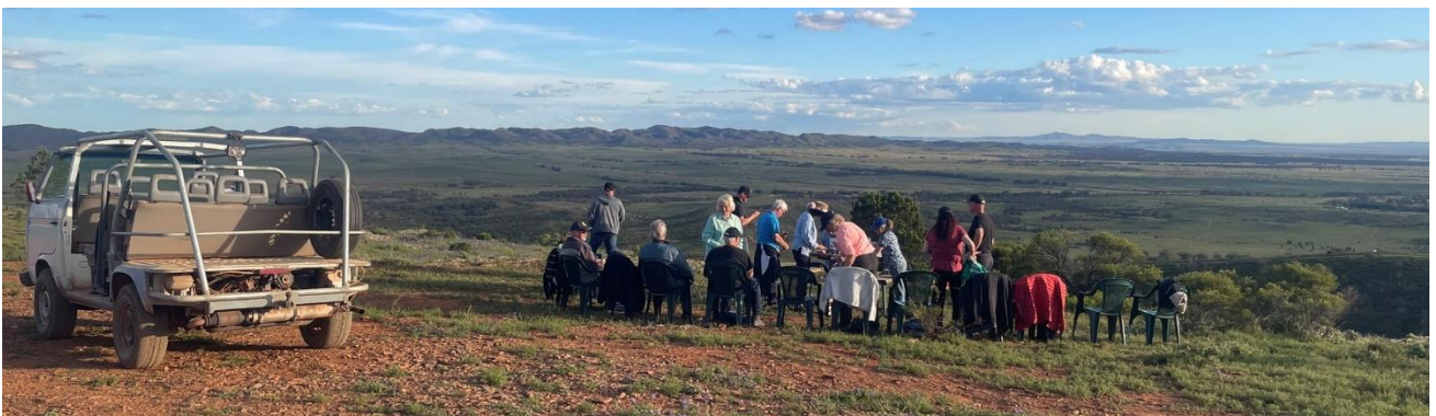
Beautiful setting for afternoon tea.