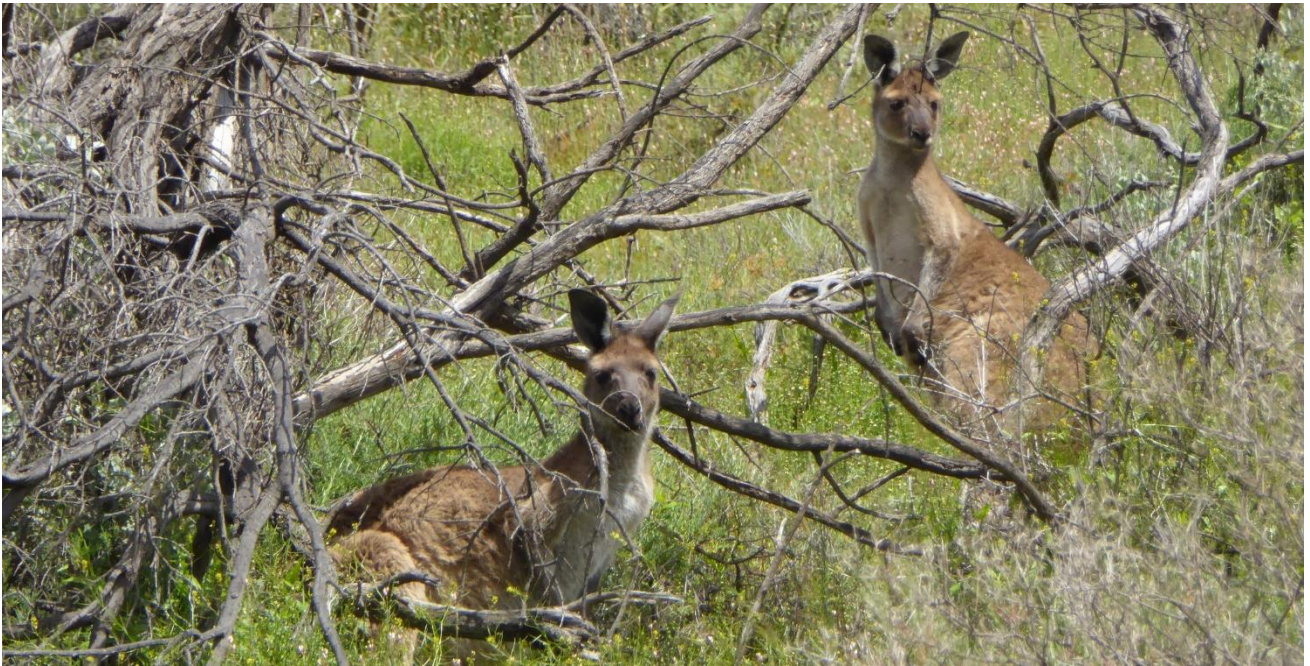
Some of the local residents.