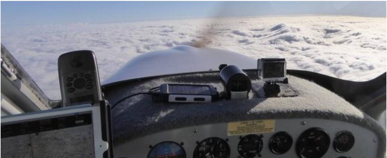
On the way to Farina – but not a picture a pilot likes to see.