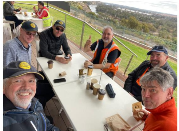
The pilots of Swagger 1 to 7 (names withheld to protect their identities 😊)