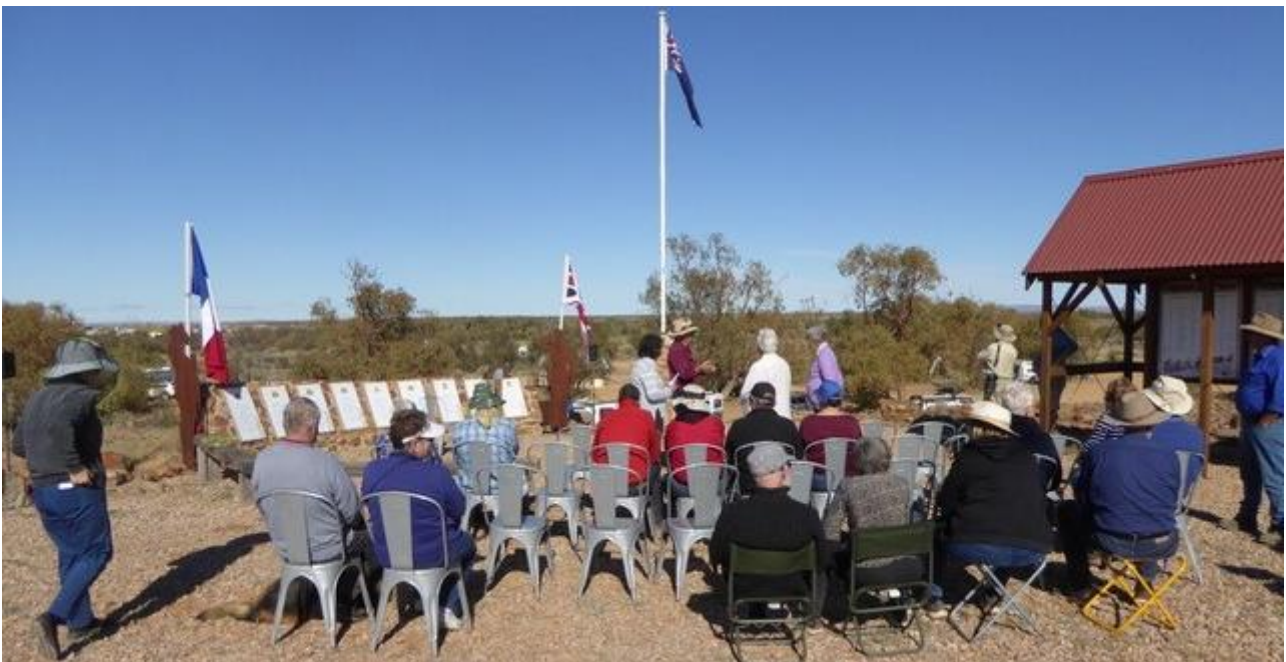
Ready for the Service