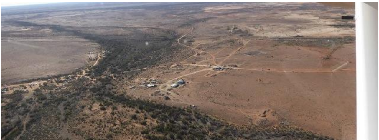
Certainly a remote location