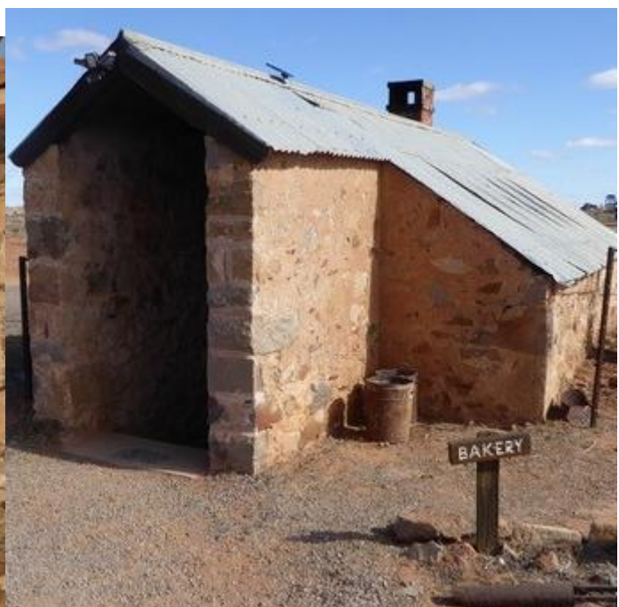
The Historic Bakery